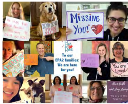
Wonderful volunteers sending SPECIAL MESSAGES to our families