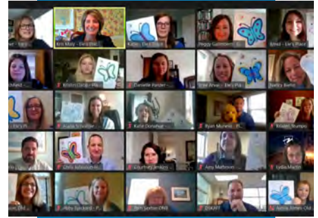
Virtual coffee hour get-together with our Healing Hearts Society Breakfast Sponsors and employees