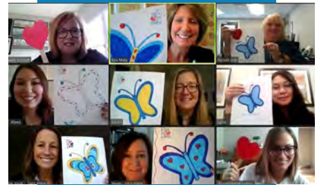
Staff Celebrates Childhood Grief Awareness Day Over Zoom