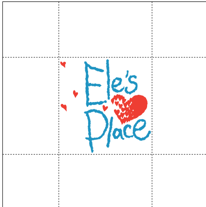
minimum of ½" clean space on all sides