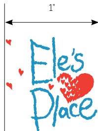
minimum reproducible size