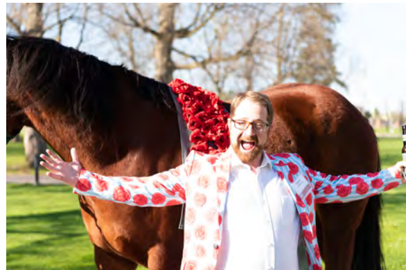
A 2022 Derby Day Soiree guest gets into the spirit of the 'Run for the Roses!'