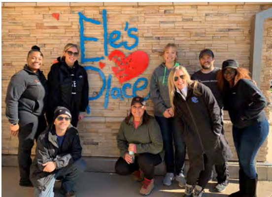
Thompson Reuters Staff helping with clean up at Ele's Place Ann Arbor