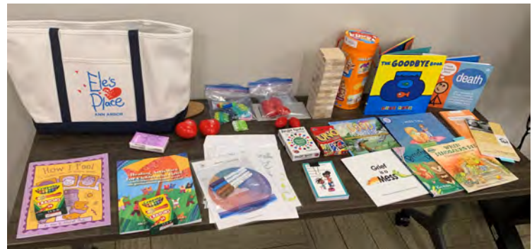
A sample of one of the 33 Grief Toolkits distributed to local elementary schools, FREE of CHARGE!