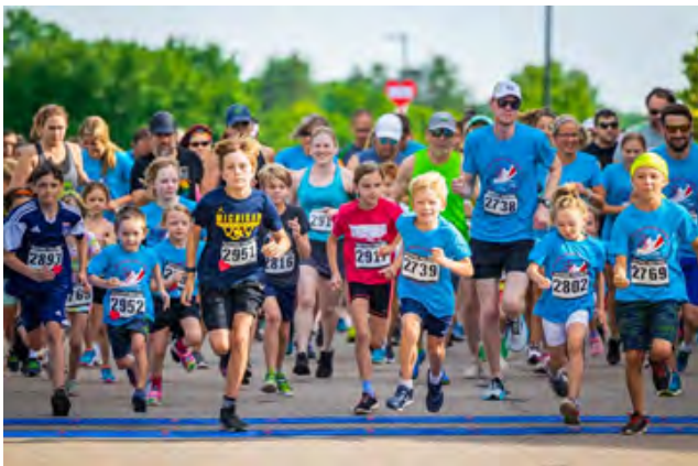
Community Support of the 2nd Annual Healing Hearts Family 5K Walk/Run

My brother and I started at Ele's Place Ann Arbor soon after our little sister died. We were both in the early elementary group together. At first, I was unsure about attending a grief group because I thought it would feel uncomfortable to share my feelings with people I didn't know well. To my surprise, it was the one place where I actually felt like I belonged during that time. It was comforting to know that the families, volunteer facilitators and staff at Ele's Place understood how I felt. Some kids in our group had a sibling die too so they truly knew what we were experiencing. The early elementary grief group provided the safe space that I needed to work on my grief. Although we had a lot of support from friends, family, and our community, it was at Ele's Place where most of my healing took place."